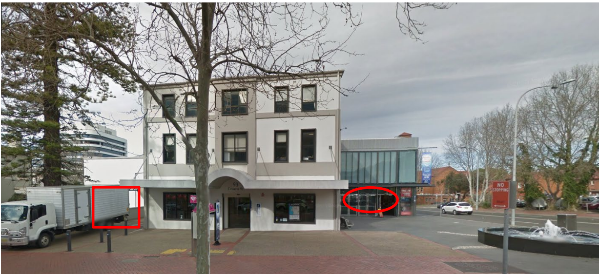
Above: Town Hall Loading Dock via The Music Lounge (left), Main Entrance (right)

The loading dock for both venues is via The Music Lounge. There is a ramp up to the Main Auditorium. Please speak to the Technical and Production Manager if you have any large items, as other arrangements may need to be made due to tight corners.