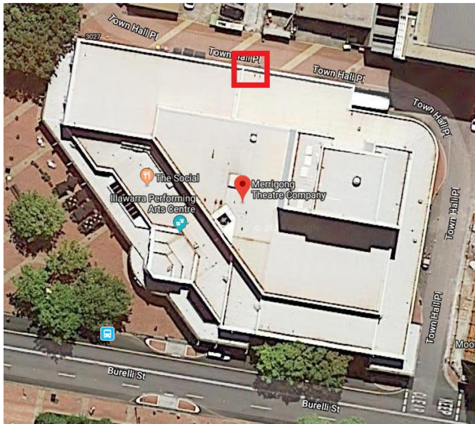
ABOVE: Bruce Gordon stage door location

Both the stage door and loading dock are located in Town Hall Place, entering from the eastern side of the “loop” road. To back in to the loading dock, it is easiest to reverse up the laneway.